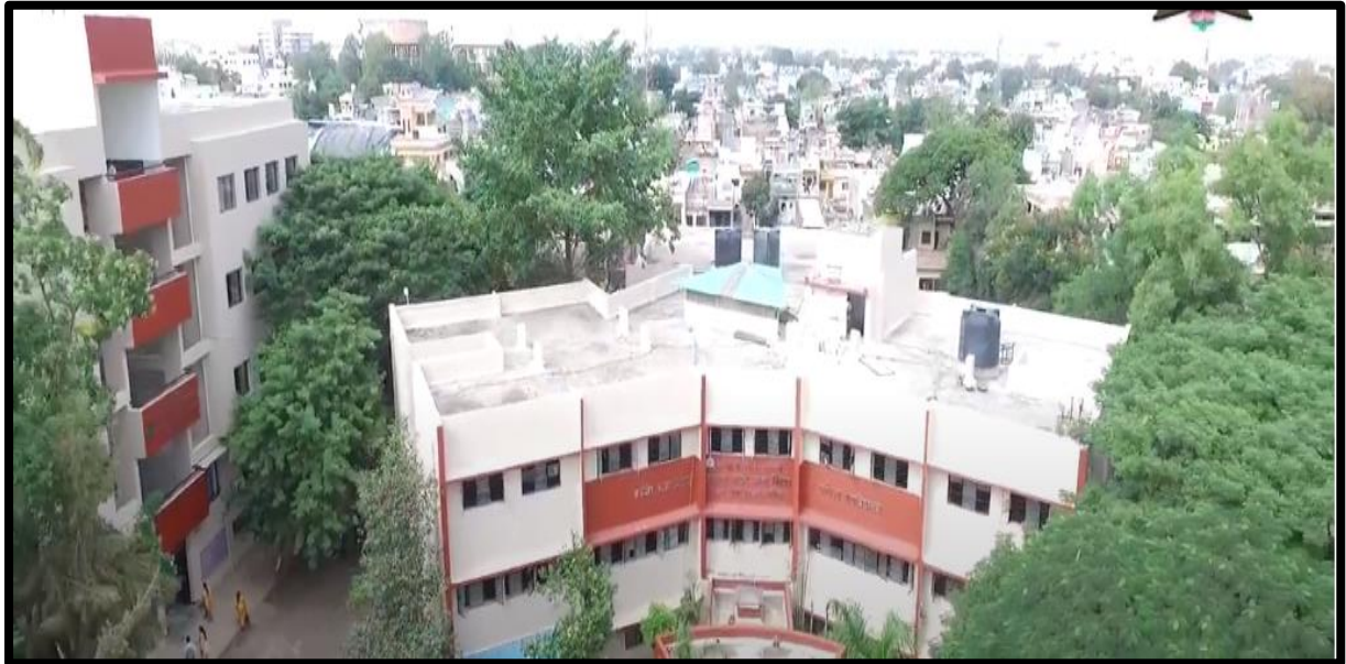
Building View 1