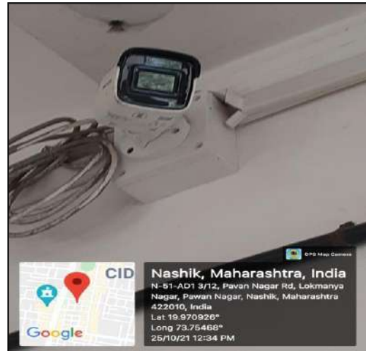
CCTV in the Staff Room