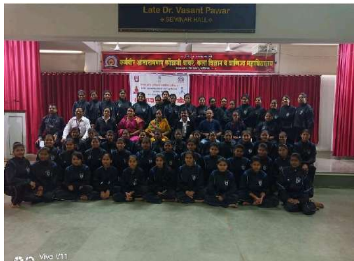
Swayam Siddha camp