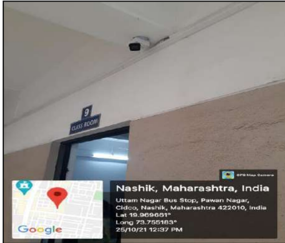
CCTV At First floor of New Building