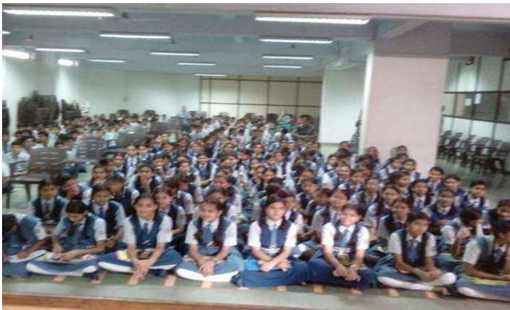
Counselling facility is provided by faculty members to our College students, Janata High school students and stakeholders