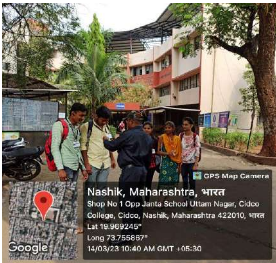
Security Guard at College Entrance Gate