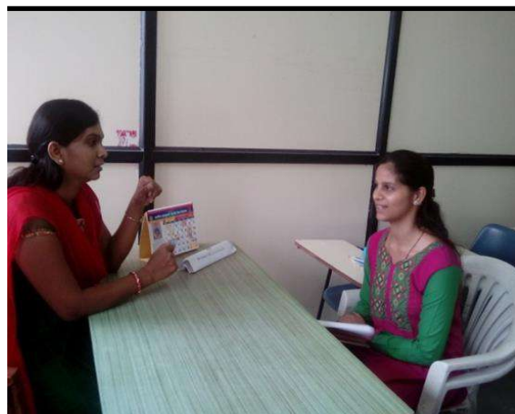
Counselling Room at Psychology Department