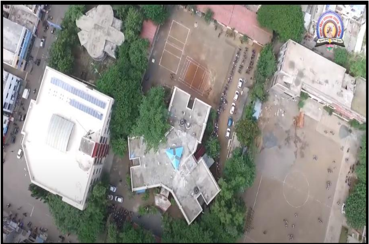
Campus View 2