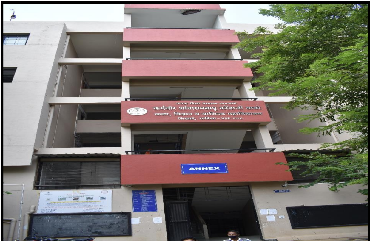
New Building 4