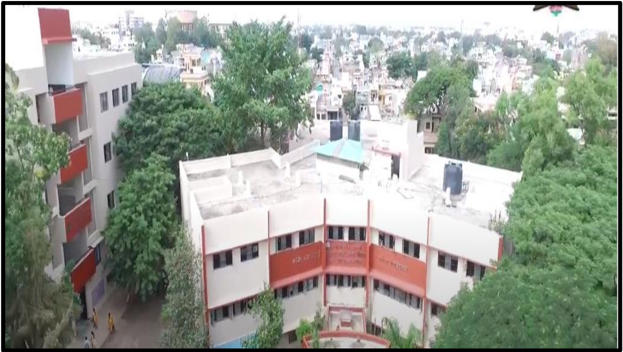
Building View 1