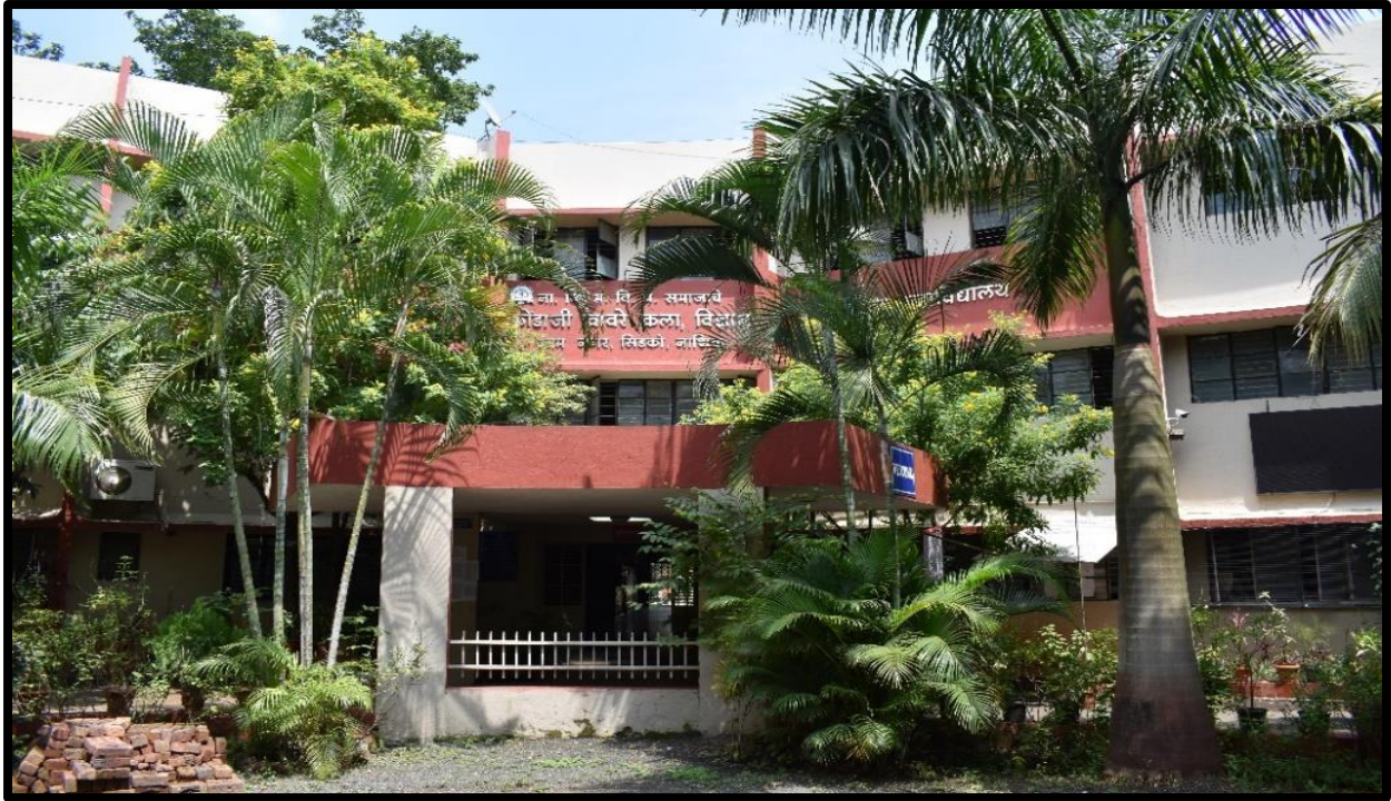
Old Building 3