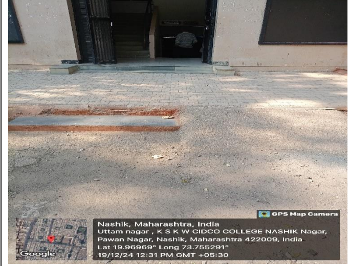
Ramp In front of New Building(Annex)