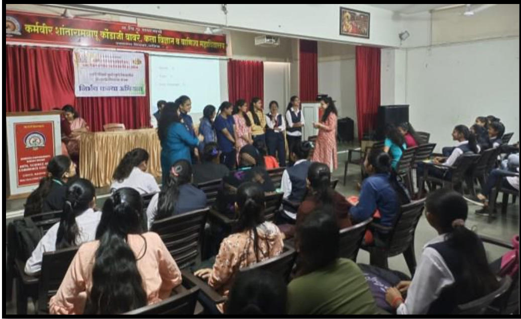
Nirbhay Kanya Abhiyan