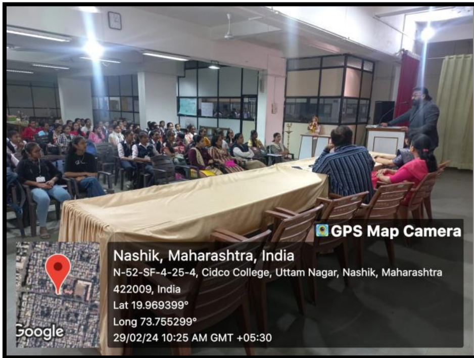
Seminar on Stress Management