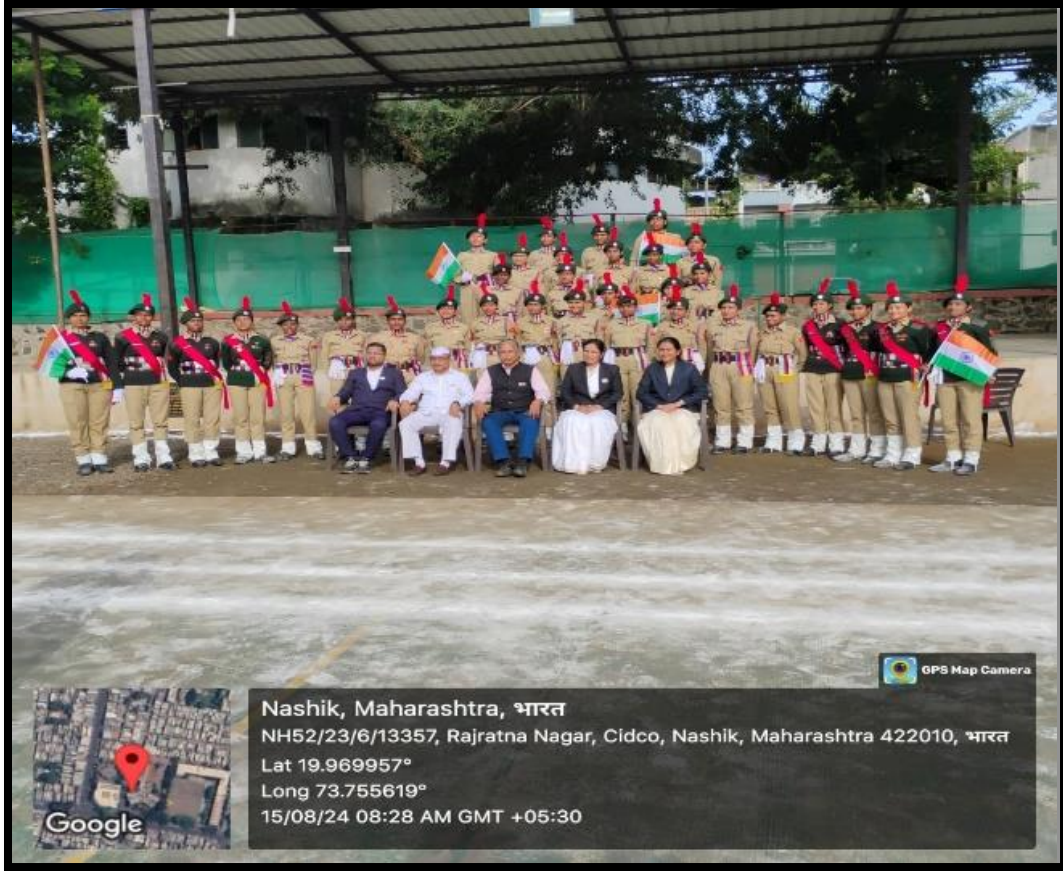
Girls NCC Unit