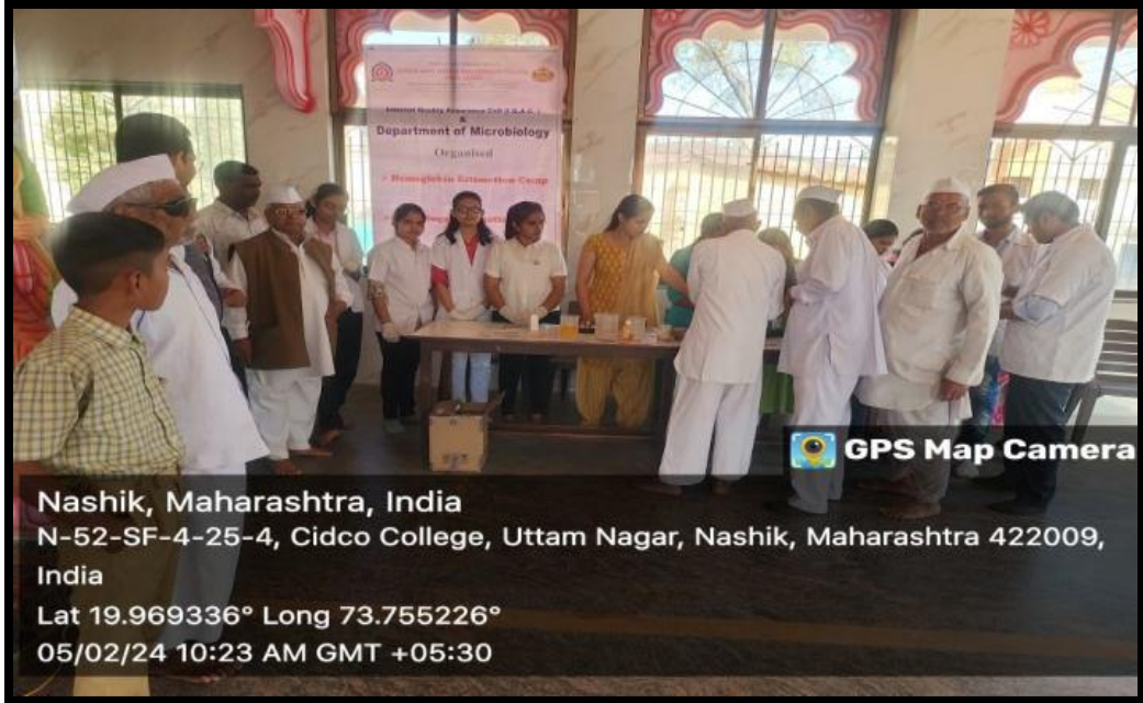
Haemoglobin and Blood group typing Camp