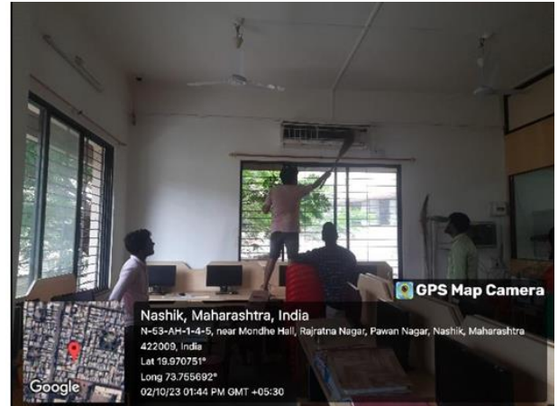
At the Institute Swachata Abhiyan 02/10/2024

8) Solid Waste management: Vermicompost is the product of the decomposition of solid waste. Unit is installed in the campus as an effective method of solid waste management, the small-scale use a varied mix of feedstocks, the Nitrogen, Potassium, Phosphorus content of the resulting vermicompost. It is used in the garden of the institute. The Institution implements effective waste management through waste segregation and recycling of the waste. Students and faculties were also actively involved by knowing their perspective about the waste management techniques in the campus.