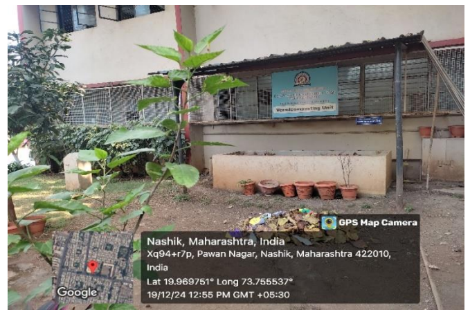
Vermicompost unit of the Institute