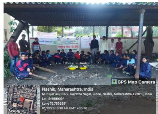
At the Institute Clean India Campaign 01/10/2023