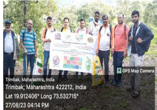
Environment awareness and plastic garbage collection activity.

6) Celebration of Ozone day: geography celebrates Ozone day every year